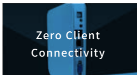
Zero Client Connectivity