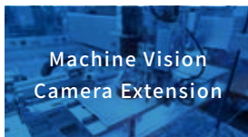
Machine Vision Camera Extension