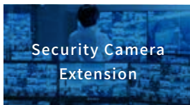
Security Camera Extension