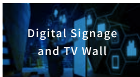
Digital Signage and TV Wall