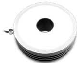
LTRN 023 NW Ring LED illuminator, white