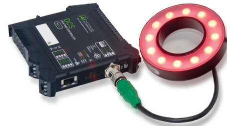
Shown with RL208-050