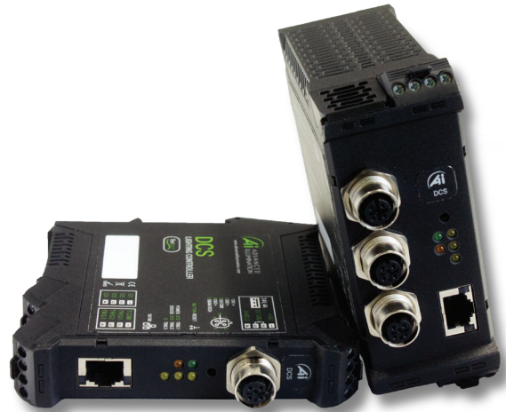
DCS-100E and DCS-103E Shown